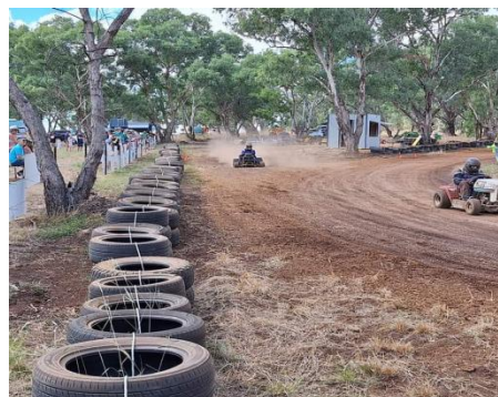
Photo: Racing action at the Easter Mower Races